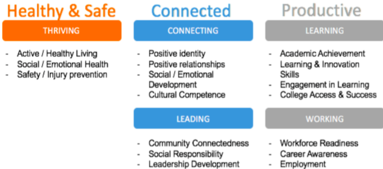
Fig. 2 Ready by 21 Outcomes Framework

These three key outcomes map directly to the Department for Digital, Culture, Media and Sport (DCMS) outcomes for children and young people: